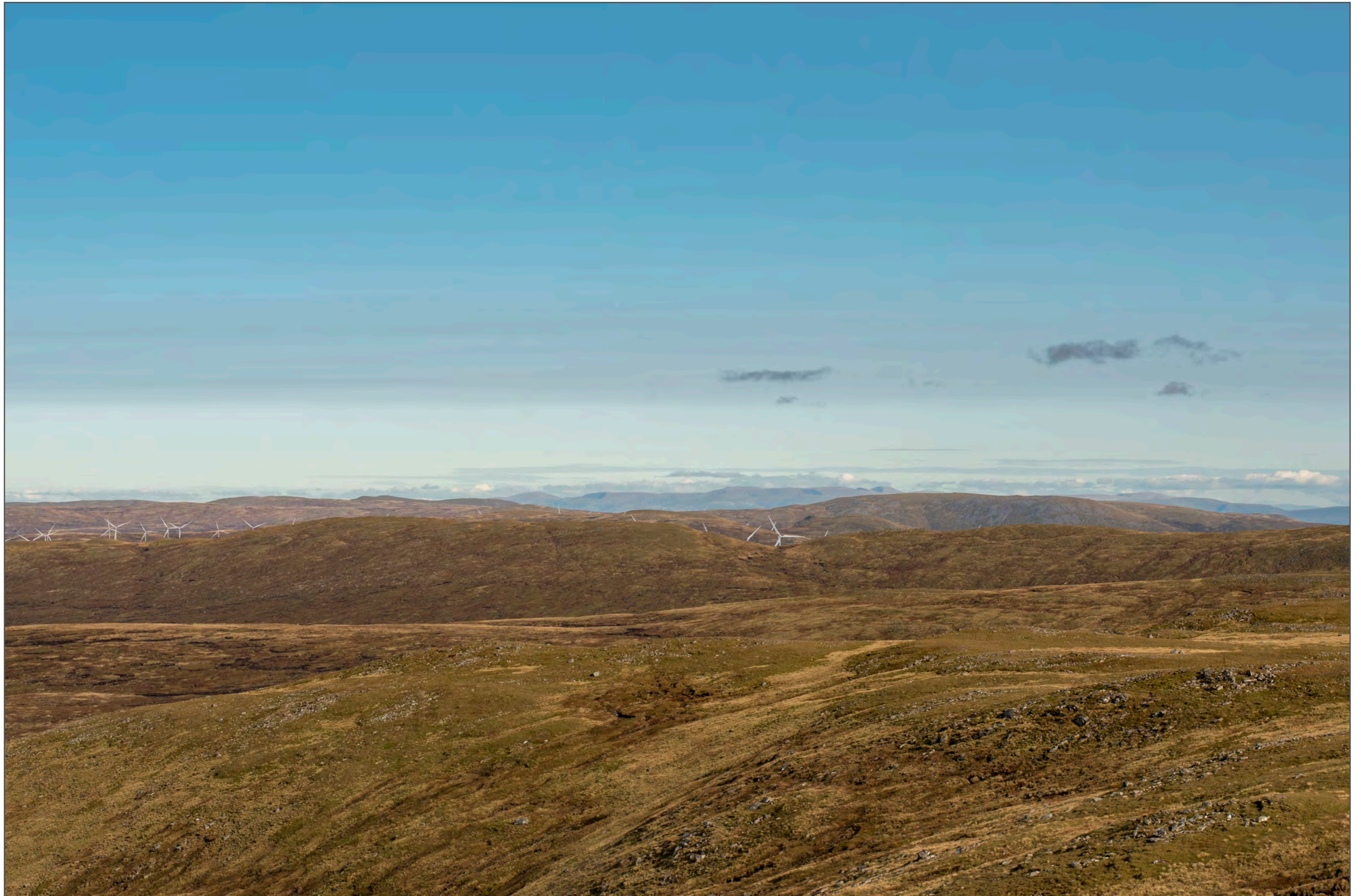
Viewpoint 3 (fig 4.10o) Corrieairack Hill

This image should be viewed at a comfortable arms length (approx. 500mm)