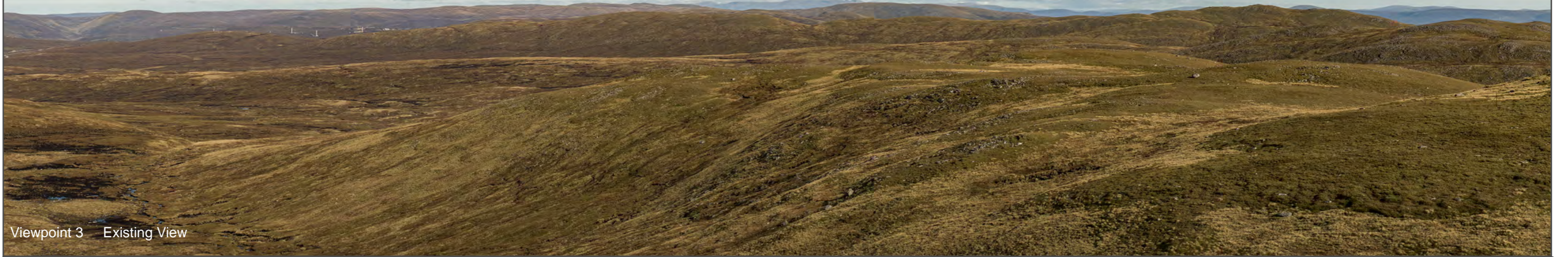
Viewpoint 3 Existing View