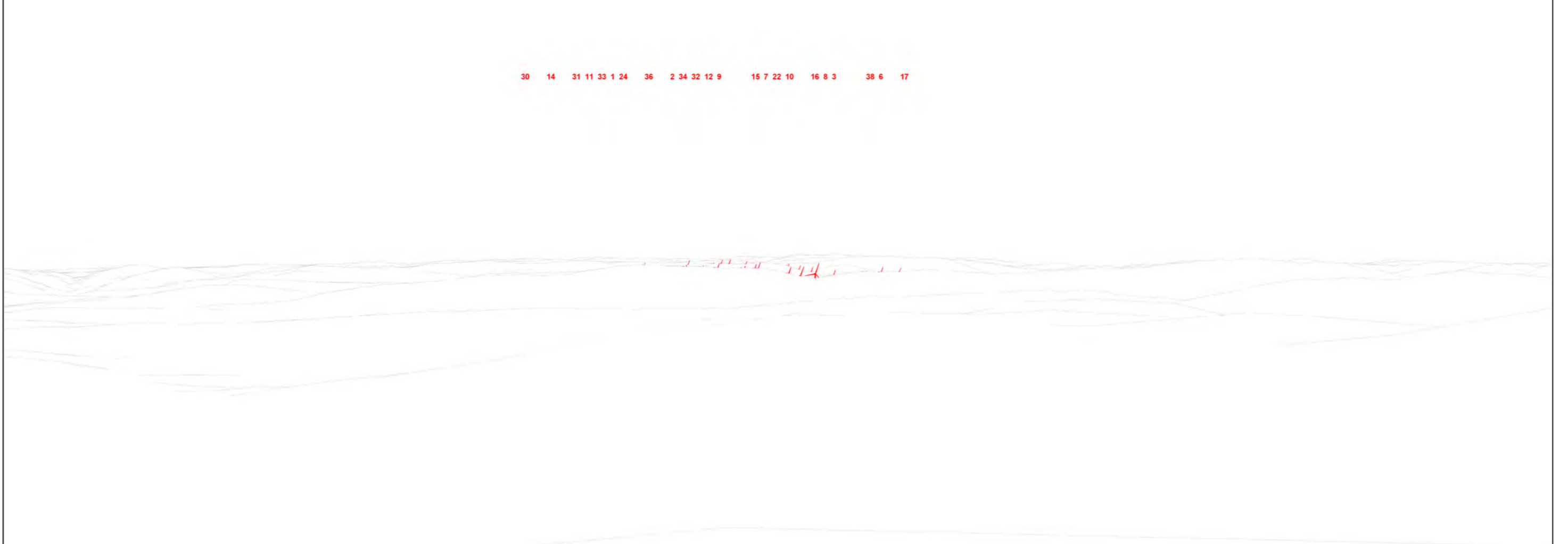
Viewpoint 3 Wireline Overlay