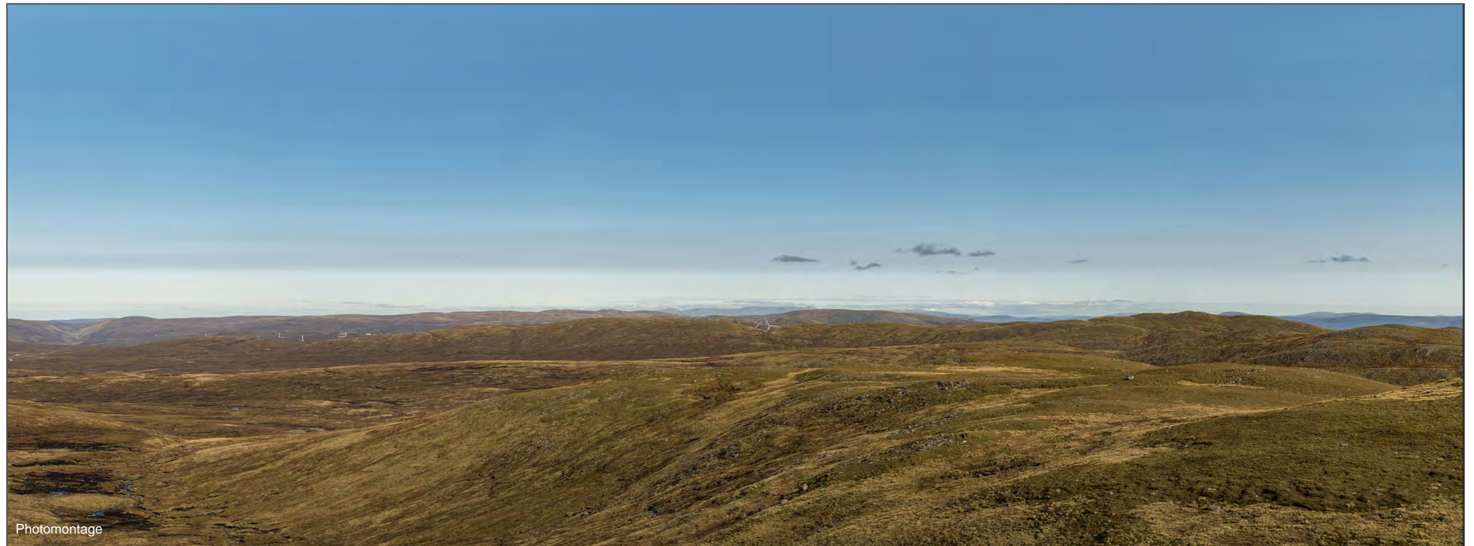
Figure 4.10i Viewpoint 3 Corrieyairack Hill

Distance to nearest turbine: 5201m Camera: Nikon D750 Focal Length: 50mm vertical (27°) x 28mm horizontal (65.5°) Camera height: 1.5m Date: 19/09/2017 15:40