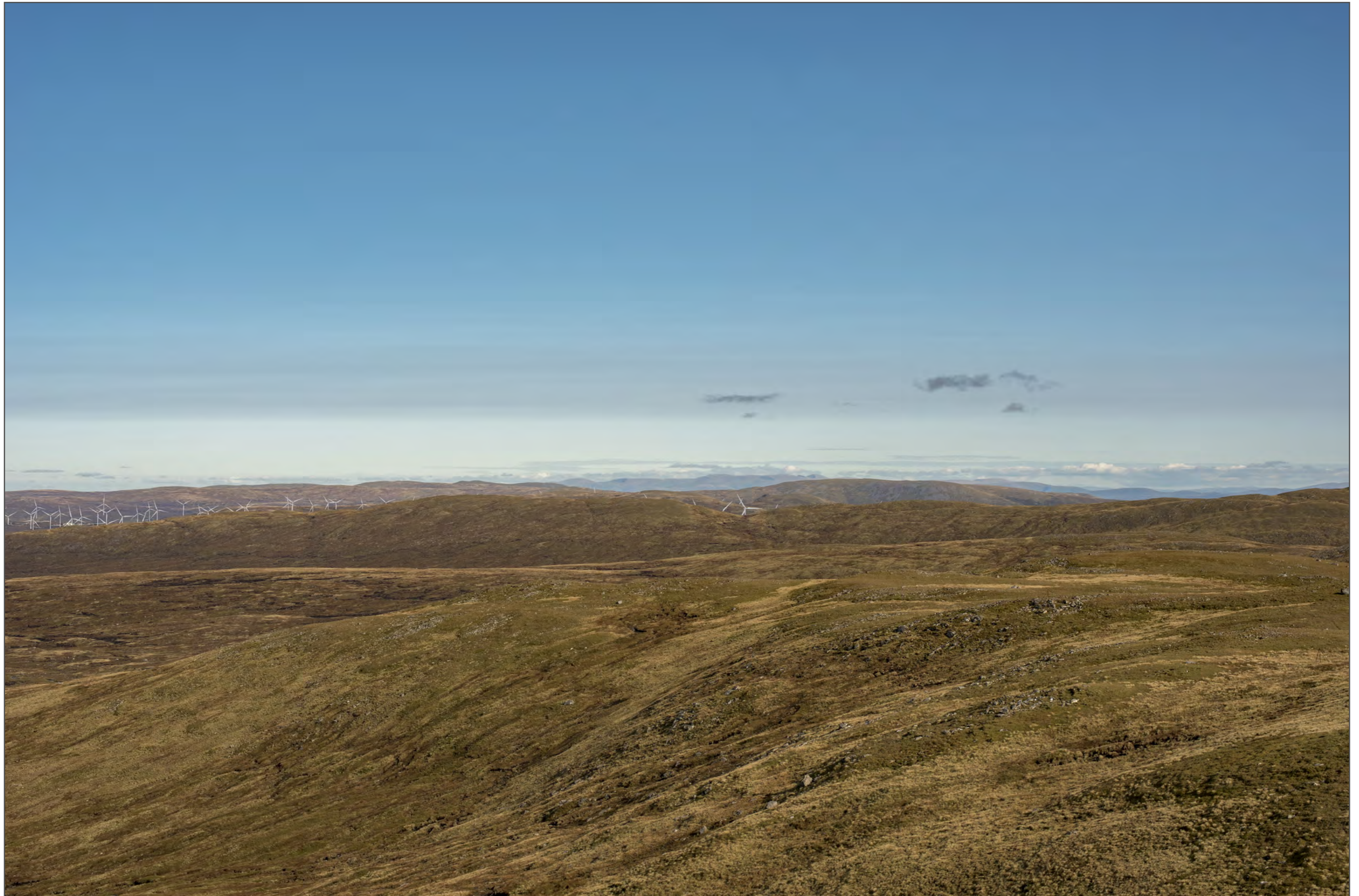
Viewpoint 3 (fig 4.10m) Corrieyairack Hill

This image should be viewed at a comfortable arms length (approx. 500mm)