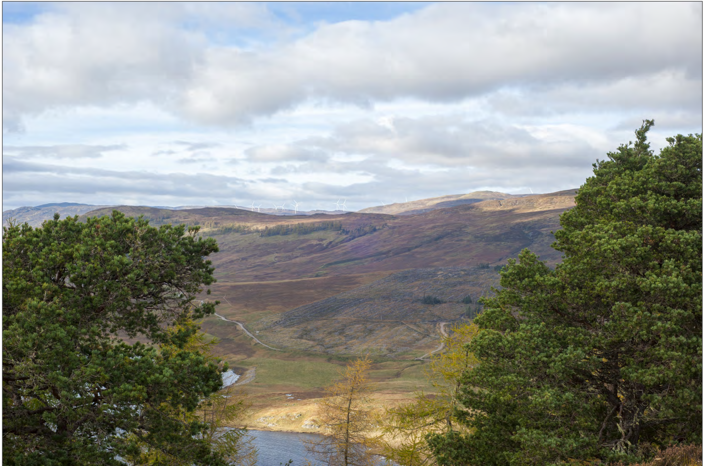
Viewpoint 11 (fig 4.18h) Dun-da-Lamh