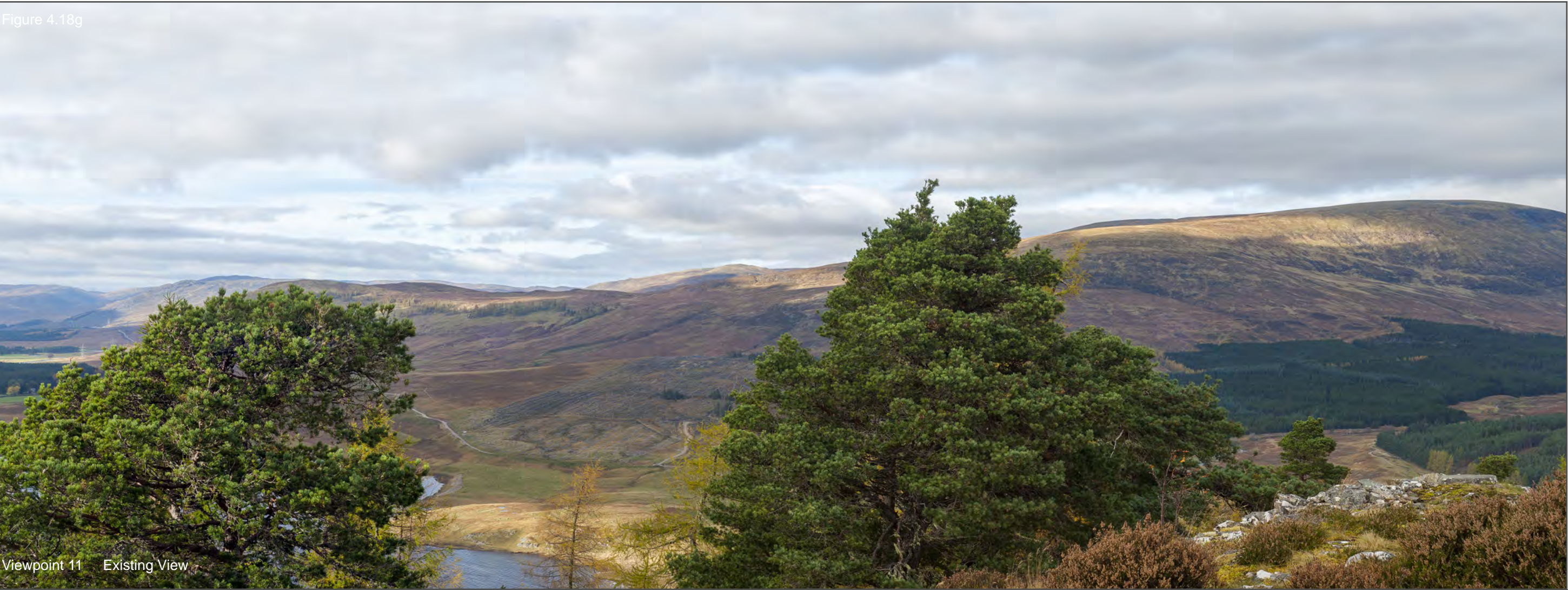
Viewpoint 11 Existing View