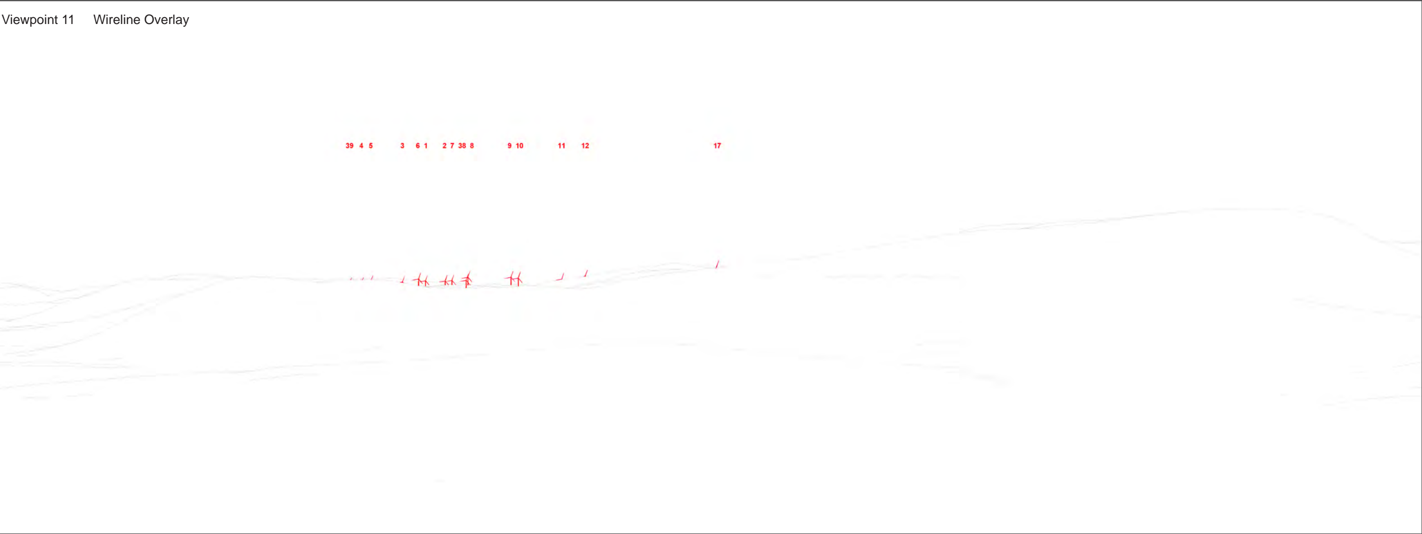
Viewpoint 11 Wireline Overlay