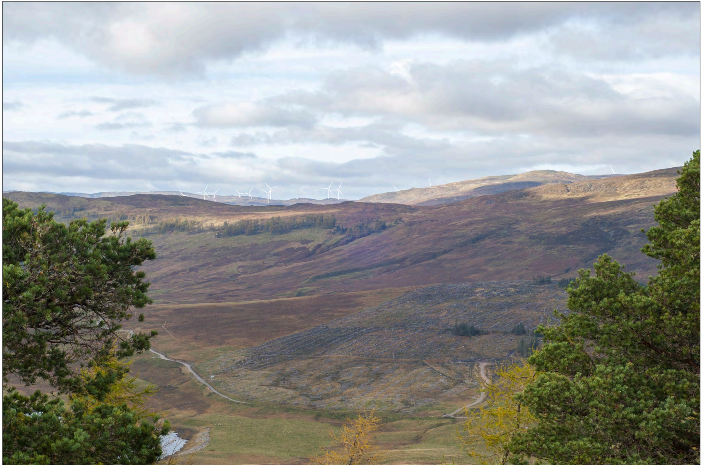
Viewpoint 11 (fig 4.18i) Dun-da-Lamh