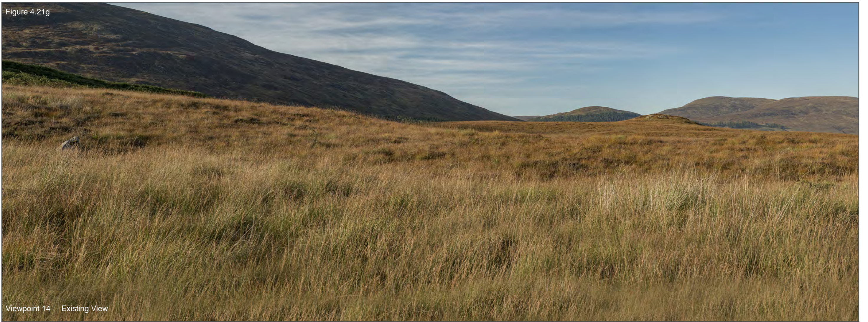
Viewpoint 14 Existing View