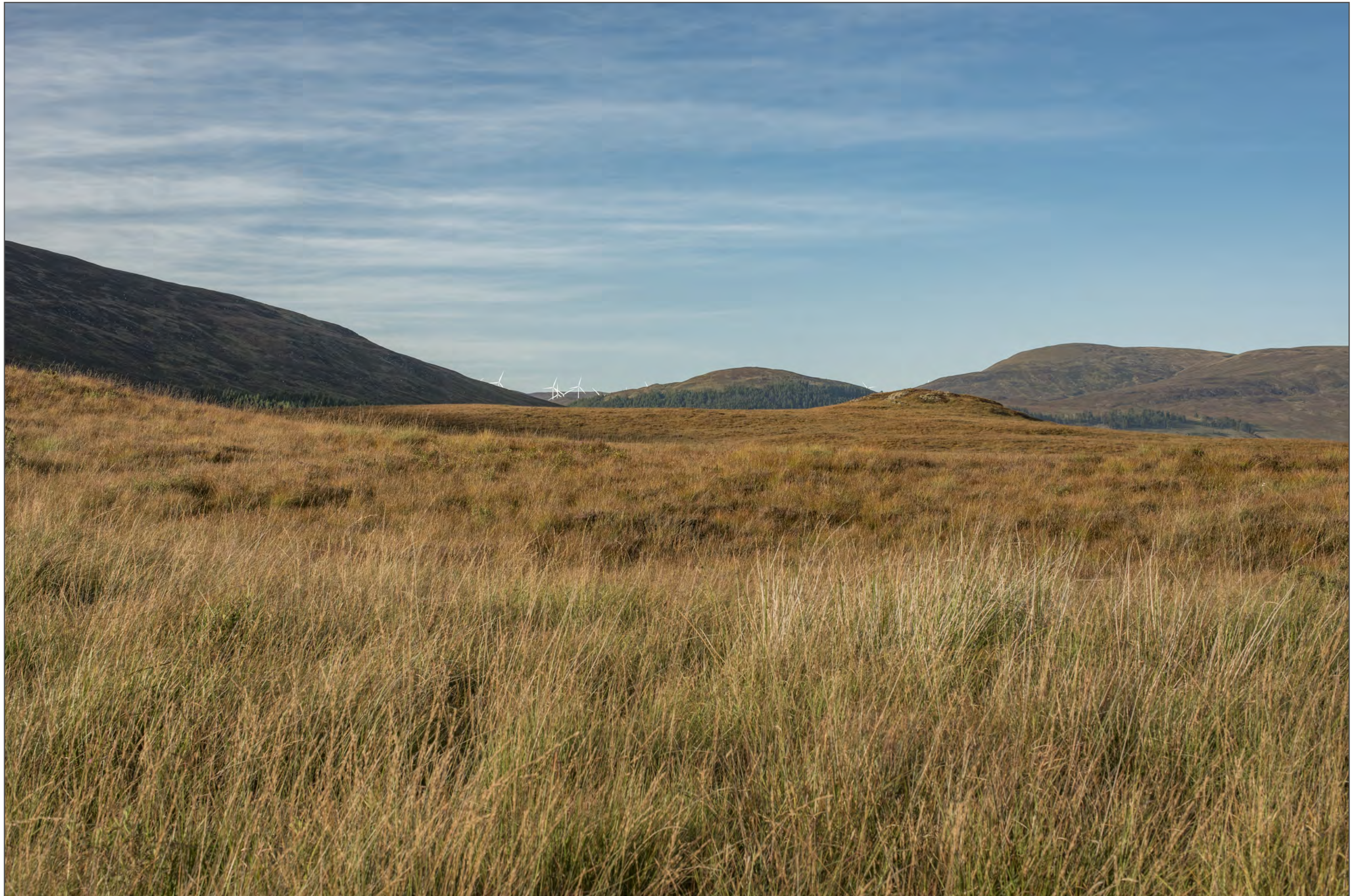
Viewpoint 14 (fig 4.21h) Aberarder Forest. On Public Right of Way

This image should be viewed at a comfortable arms length (approx. 500mm)