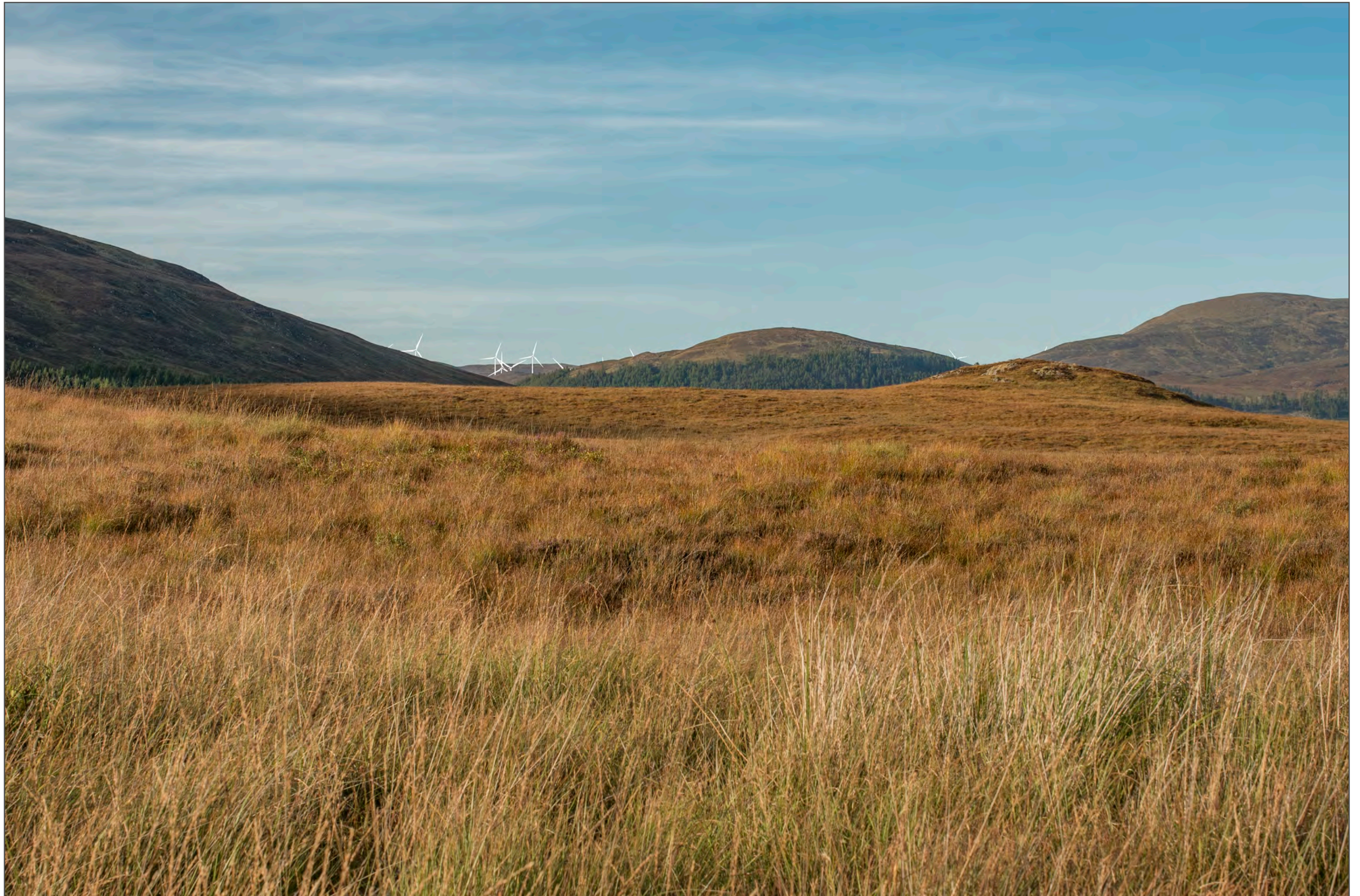
Viewpoint 14 (fig 4.21i) Aberarder Forest. On Public Right of Way

This image should be viewed at a comfortable arms length (approx. 500mm)