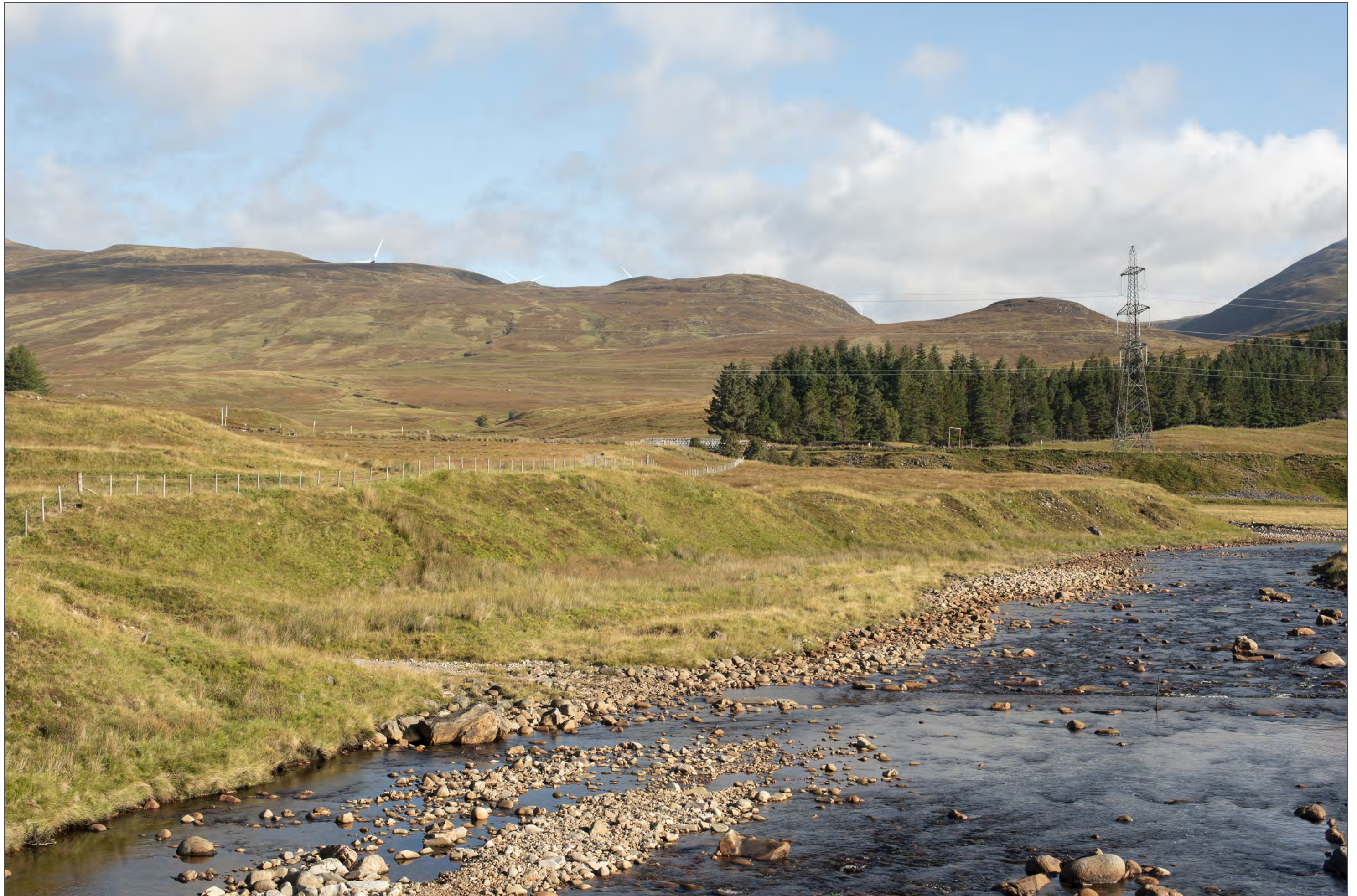
Cultural Heritage Photomontage Viewpoint 2 (fig 5.7h) Garva Bridge, LB6900

This image should be viewed at a comfortable arms length (approx. 500mm)