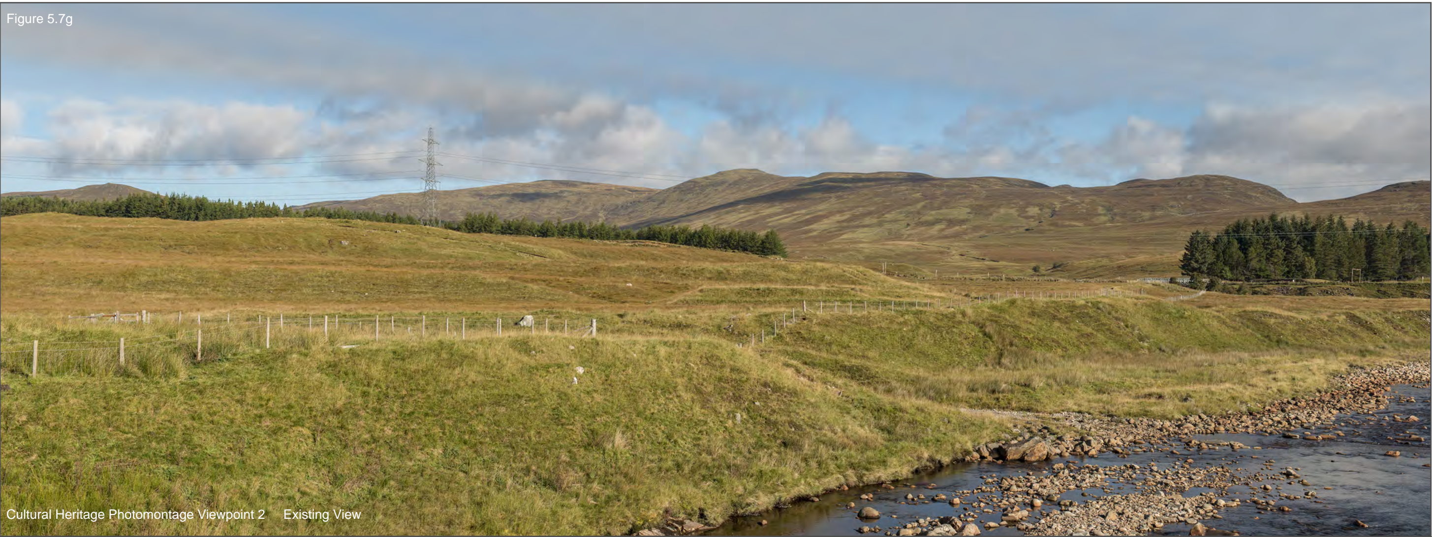
Cultural Heritage Photomontage Viewpoint 2 Existing View