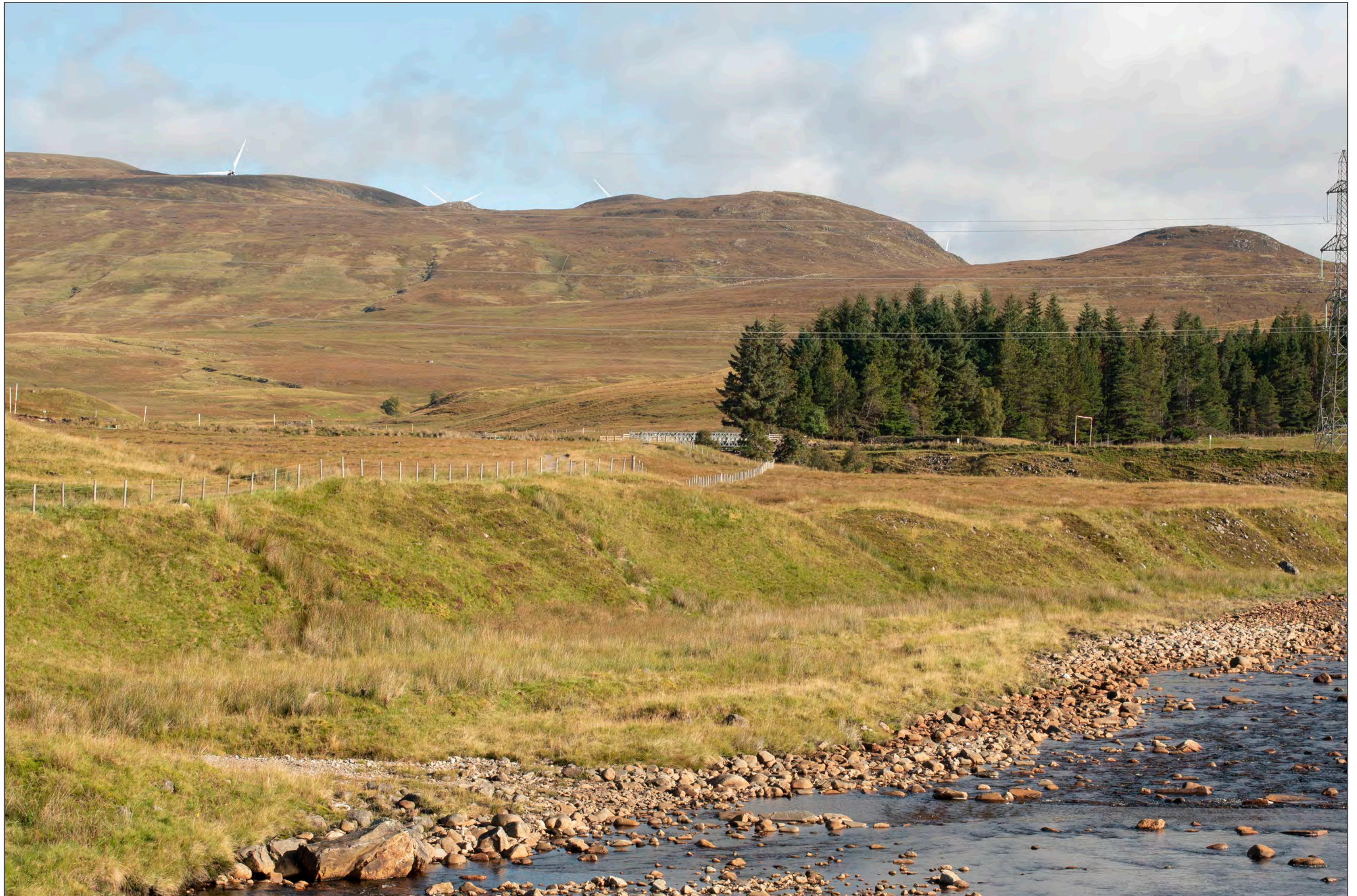
Cultural Heritage Photomontage Viewpoint 2 (fig 5.7i) Garva Bridge, LB6900